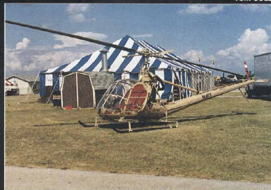
Albert Crawford's Hiller HTE-2 helicopter. The Navy acquired 16 of these light helicopters in the early 1950s; both the U.S. Army and the Navy used the helicopter in Korea. Some were also pressed into service in Vietnam until retirement in 1971.