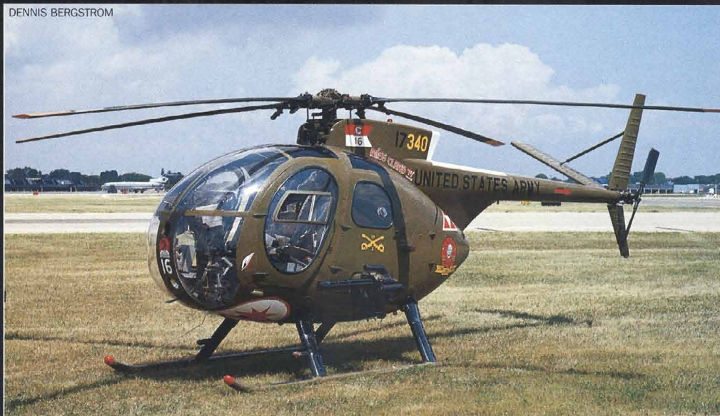
AAHF Hughes OH-6 Loach.