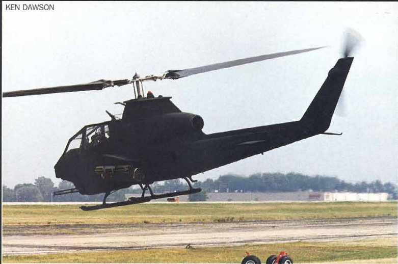
The Army Aviation Heritage Foundation's Bell AH-1 Cobra which, along with its "brethren," staged a breathtaking demonstration of Vietnam operations.

The magnificent display by the Army Aviation Heritage Foundation at AirVenture featured a unique and growing portion of the warbird movement—helicopters. We've had 'copters (don't call them "choppers" to a rotary wing pilot!) grace the warbird ramp at Oshkosh in previous years, but never before have we had the numbers and the variety of types featured in 2000. The Vietnam era was truly represented by these birds!