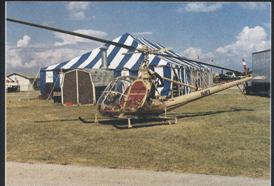
Albert Crawford's Hiller HTE-2 helicopter. The Navy acquired 16 of these light helicopters in the early 1950s; both the U.S. Army and the Navy used the helicopter in Korea. Some were also pressed into service in Vietnam until retirement in 1971.