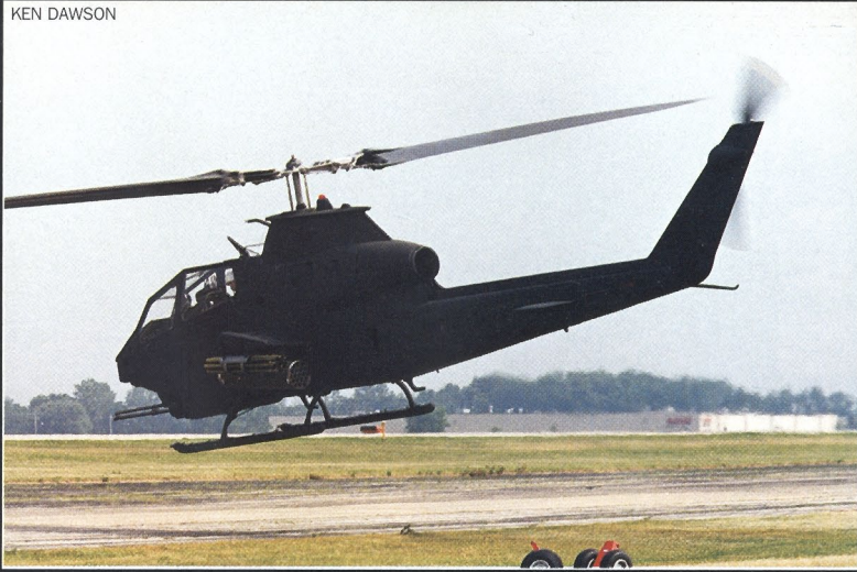
The Army Aviation Heritage Foundation's Bell AH-1 Cobra which, along with its "brethren," staged a breathtaking demonstration of Vietnam operations.

The magnificent display by the Army Aviation Heritage Foundation at AirVenture featured a unique and growing portion of the warbird movement—helicopters. We've had 'copters (don't call them "choppers" to a rotary wing pilot!) grace the warbird ramp at Oshkosh in previous years, but never before have we had the numbers and the variety of types featured in 2000. The Vietnam era was truly represented by these birds!