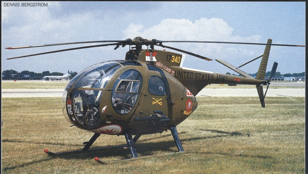
AAHF Hughes OH-6 Loach.